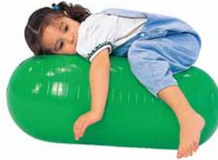
Gym Roll, Item #s 38444 & 38445