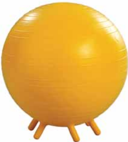
Feetball, Item #s 6706 & 6608

This is a great tool for beginning practitioners to use in therapy. The amount of control and coordination needed to manage by the practitioner is much less than with a regular therapy ball.