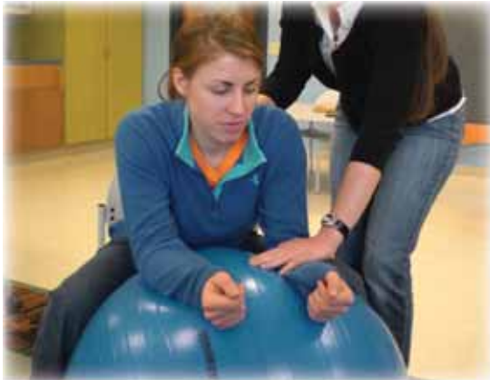
Body Ball, Item #s 2677, 2679, & 2690