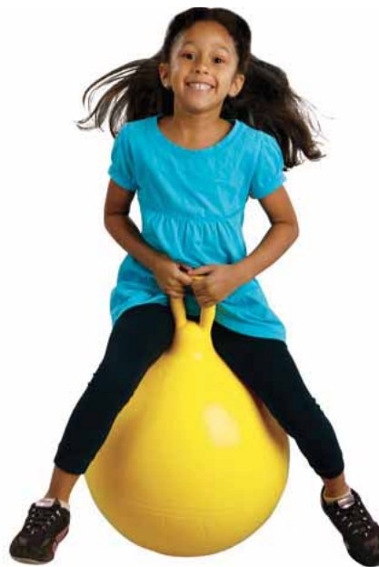
FlagHouse Hop Ball, Item #s 5588 & 5597

Use the hop ball to facilitate core muscle strength and to build muscle tone in the lower trunk. The handles allow the user to control the amount and direction of the bounce.