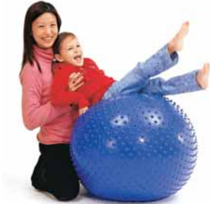
Therapy Massage Ball, Item # 38446

A large ball is preferred when sitting on the ball and working on balance activities. When the feet are raised off the ground, it facilitates greater balance reactions and reflexes.