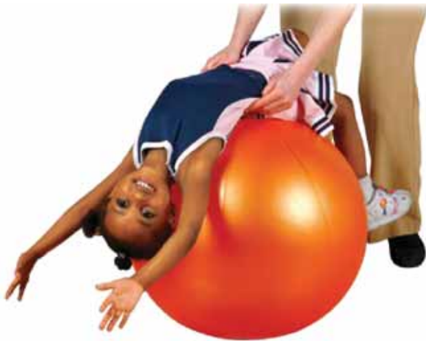
Therapy Balls, Item #s 3057, 6963, 3069, 6775, 6619, 3074, & 3082

When working with infants and small children with rolling and sitting on the ball, make sure that you are able to handle and control both the user and the ball simultaneously.