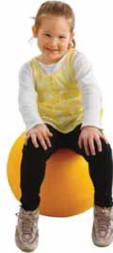
Football, Item #s 6706 & 6608

A smaller ball may be used when working on balance activities and when more stability is needed for the user who is sitting on the ball.